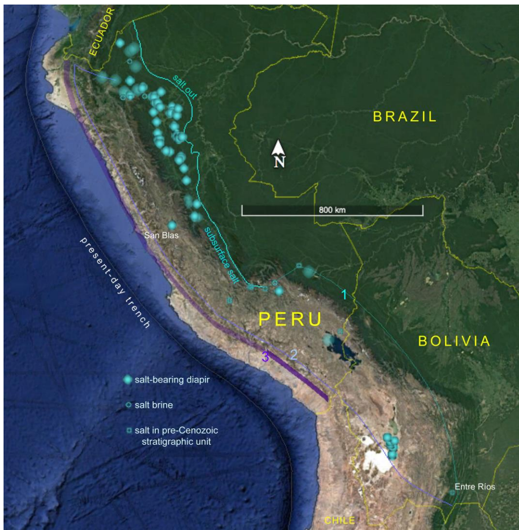
Figure 1. Outline of the possible extension of the salt basin, considering both autochthonous and allochthonous salt. Blurry symbols indicate an imprecise position. Line 1: eastern limit of autochthonous salt (hypothetical in southern part of map); line 2: hypothetical western limit of salt (which is expected to have been in part allochthonous); line 3: position of the magmatic arc during Pucará times (the actual arc was broader than the illustrated line); all lines are hypothetical where thin or blurry. This map does not show the other elements used to construct it, such as the numerous occurrences of other evaporites and the structural proxies detailed in text. This map suggests that the salt basin should be expected to extend into Ecuador, but no corresponding salt has been reported from this country so far (see Baby et al., 2014).

In the Late Triassic rift basin, salt accumulated along with other evaporites such as gypsum and anhydrite, as confirmed by a variety of observations (e.g., Benavides 1962/1968; Marocco, 1975). Thus outcrops of these sulfates, especially where they are stratigraphically located between the Mitu and Pucará groups, can be used to outline the original extension of the “salt” basin.